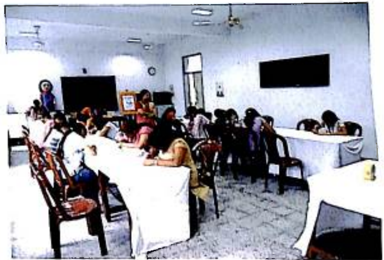
Sudoku Competition in Progress