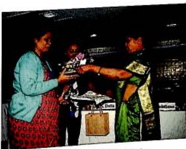
Senior Scientist Award Presentation