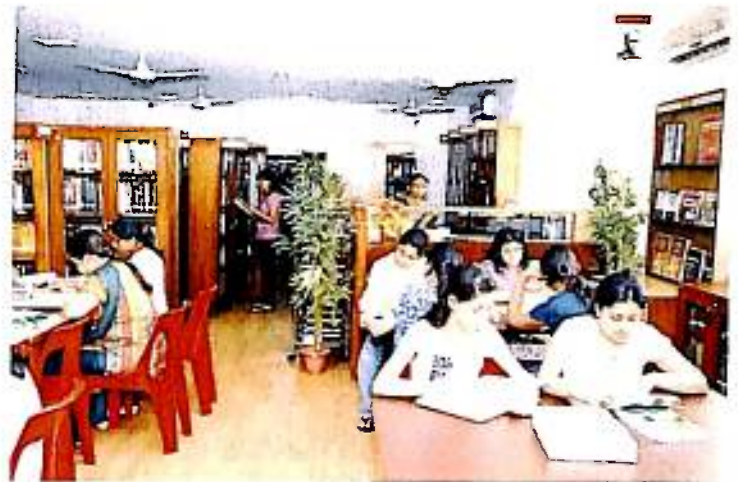
Library at Main Campus