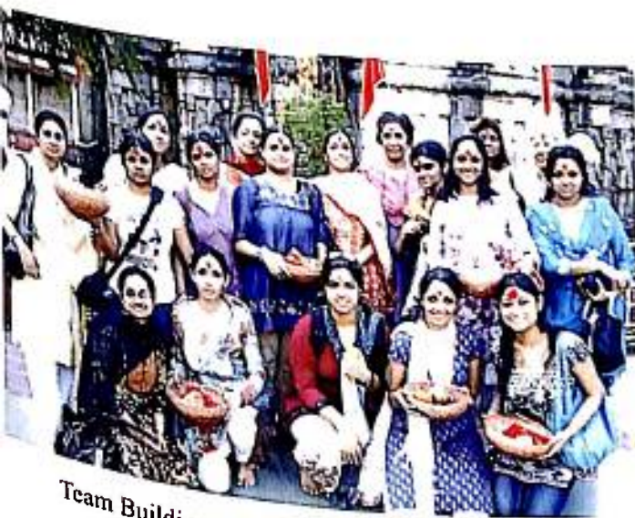
Team Building during an Educational Excursion