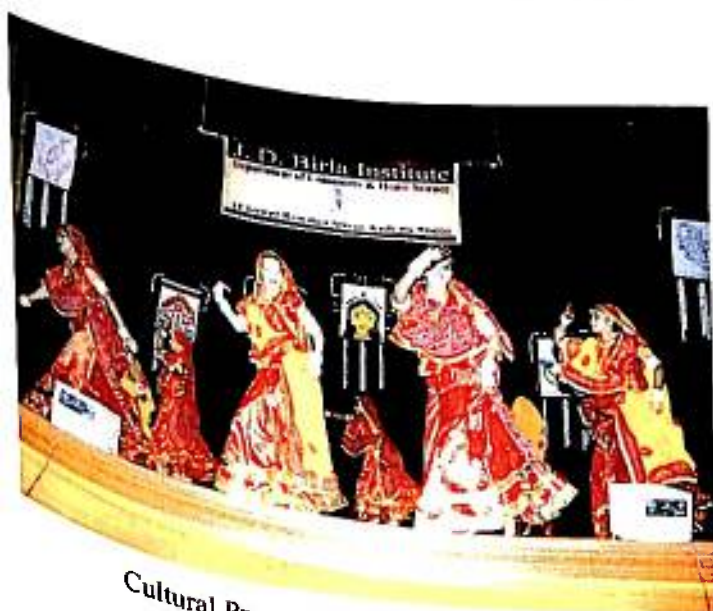
Cultural Programme put up by students