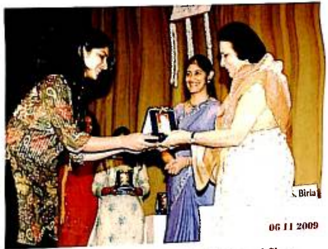
Awards to Meritorius Students at the Annual Show