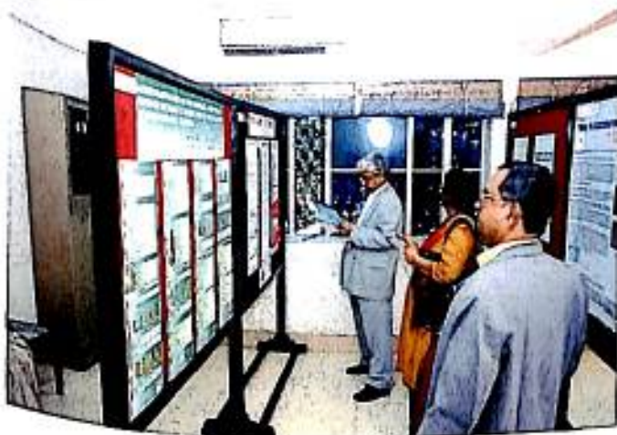
Judges review the Poster Presentation