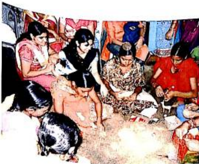
Students with Village workers