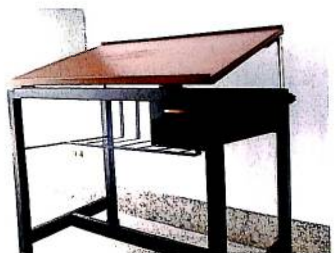
New Furniture - Drawing Tables at the Drawing Studio