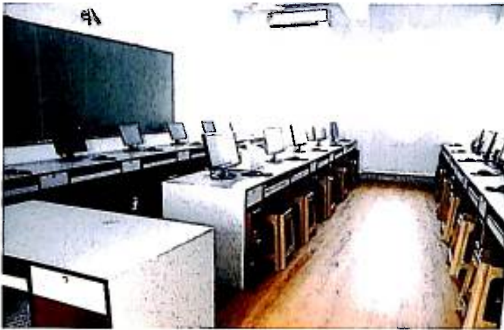
New Computer Aided Design Studio