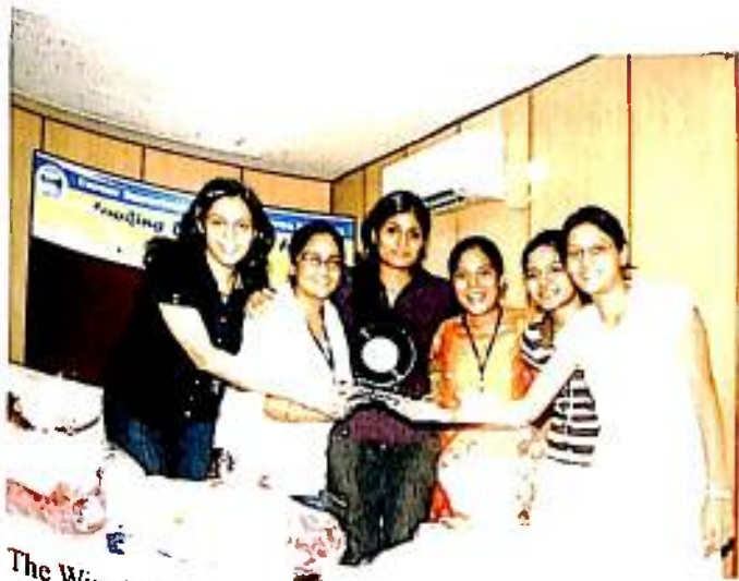
The Winning Team at the Seminar on Career Opportunities- For Commerce Students - 'Looking Beyond the Horizons'