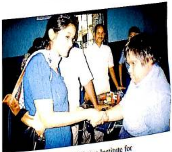
Students at Chetna Institute for Mentally Handicapped Children