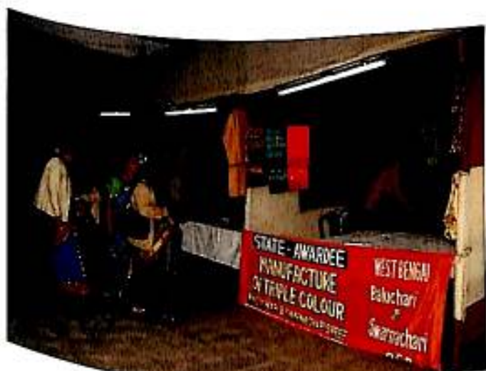
Crafts Bazaar organized at the Conference