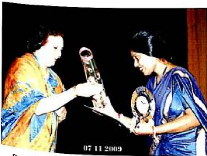
Faculty Member being Awarded by the Management on Teachers' Day, 2009