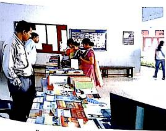
Book Fair at the Main Campus