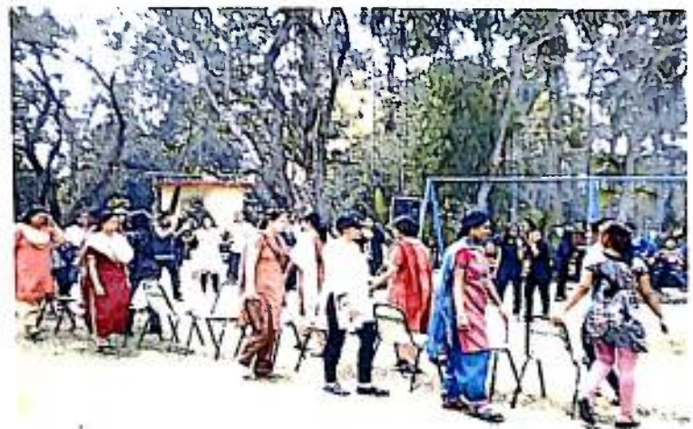
Students' & Teachers' Picnic