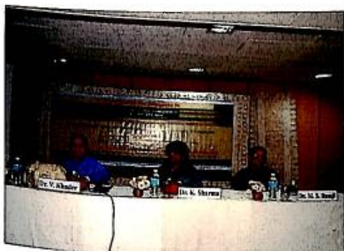
Well known Academicians at the Technical Session