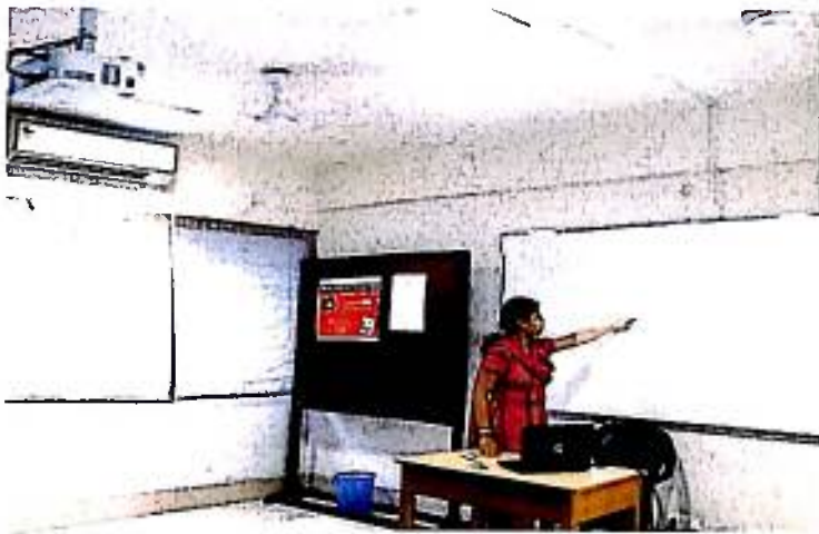
LCD Projectors installed in Class Rooms