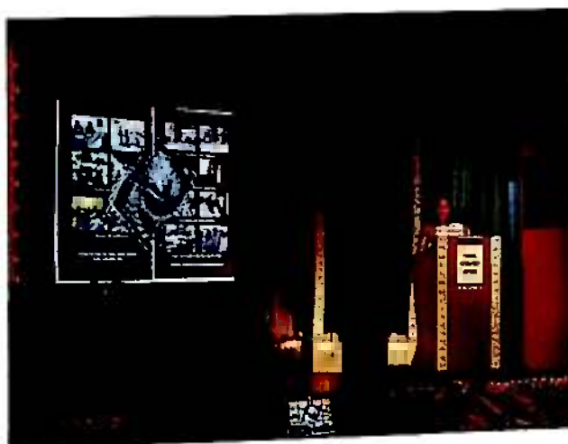
Oral Presentation by Young Scientist