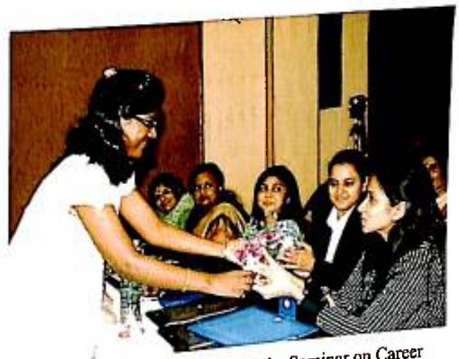
The Judges being felicitated at the Seminar on Career Opportunities- For Commerce Students - 'Looking Beyond the Horizons'